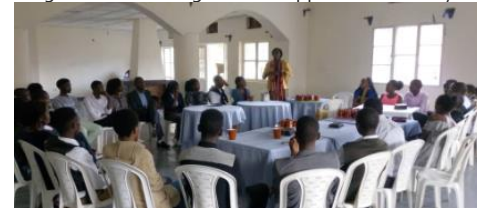
Graduates from INES sharing a meal with GBU

In the same line, GBUR salutes graduates from different GBUs who are contributing to different farewell parties among students. It is encouraging for students to see their graduates coming back to support the ministry.