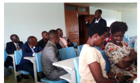
Graduates from UR-Nyagatare coming together