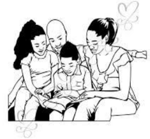
6. EVANGELISE & DISCIPLE