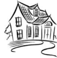
5. REACH HOMES